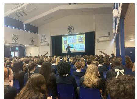
Leading assemblies for all our year 8 and 9 students.